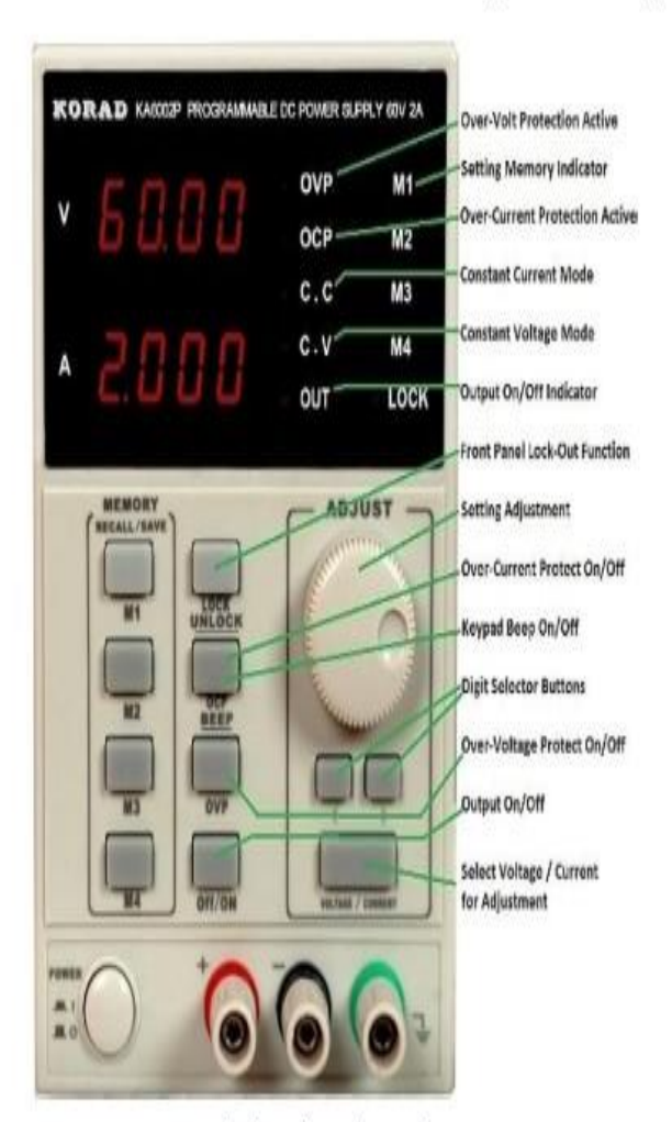
Roll over image to zoom in